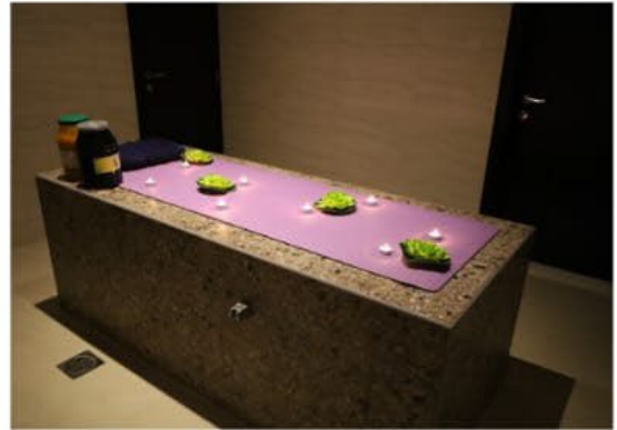
Moroccan Bath with Massage