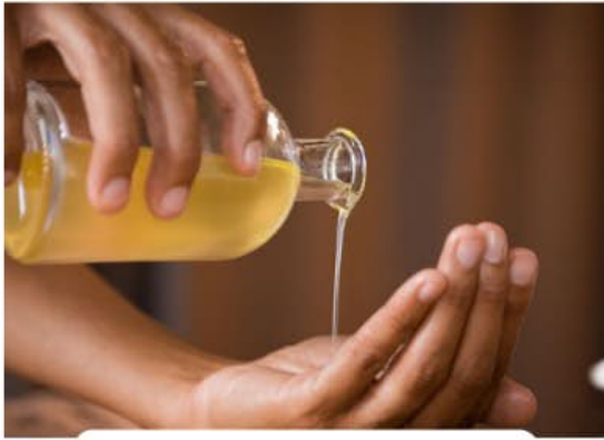
Special Oil Massage