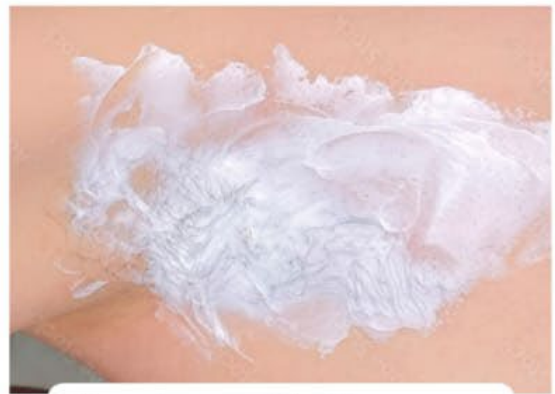
Shaving with Massage