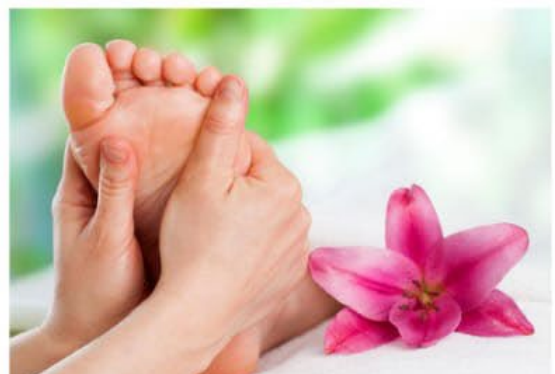
Foot Massage with Nail Cutting